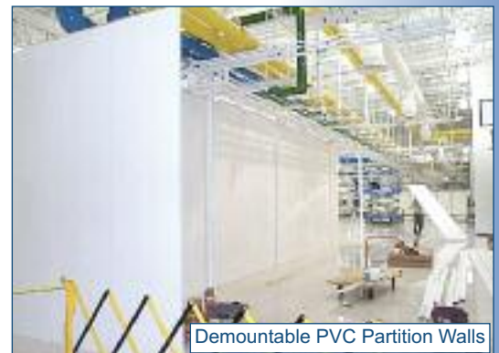
Demountable PVC Partition Walls