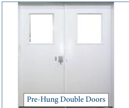
Pre-Hung Double Doors

Since 1992 Extrutech Plastics has been committed to developing unique products to serve the wide spectrum of our customers' distinctive needs. Our attractive, cost-effective panels will fill most special requirements - from clean rooms to laboratories. We can cover your walls and ceilings and replace your doors with superior products that your inspectors will love! Extrutech Plastics is continually working to improve current methods, while developing new ideas and concepts into innovative products that meet the ever-changing needs of our current and future customers. Call us for a free quote on your next project - toll free at 888-818-0118.