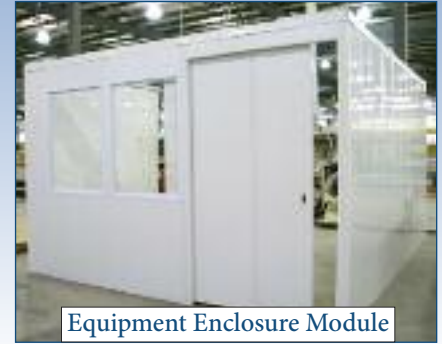
Equipment Enclosure Module