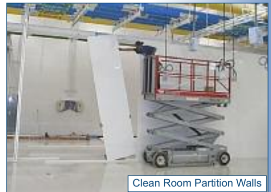
Clean Room Partition Walls

Phone 888-818-0118 FAX 920-684-4344 Email: info@epiplastics.com