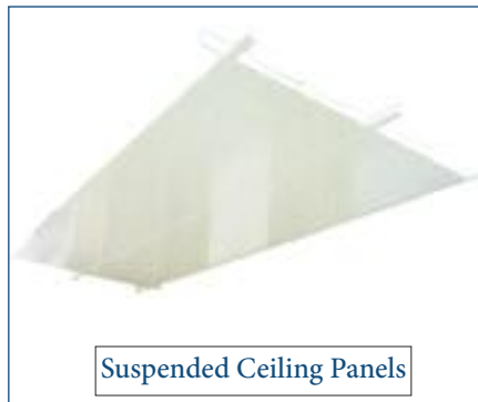
Suspended Ceiling Panels